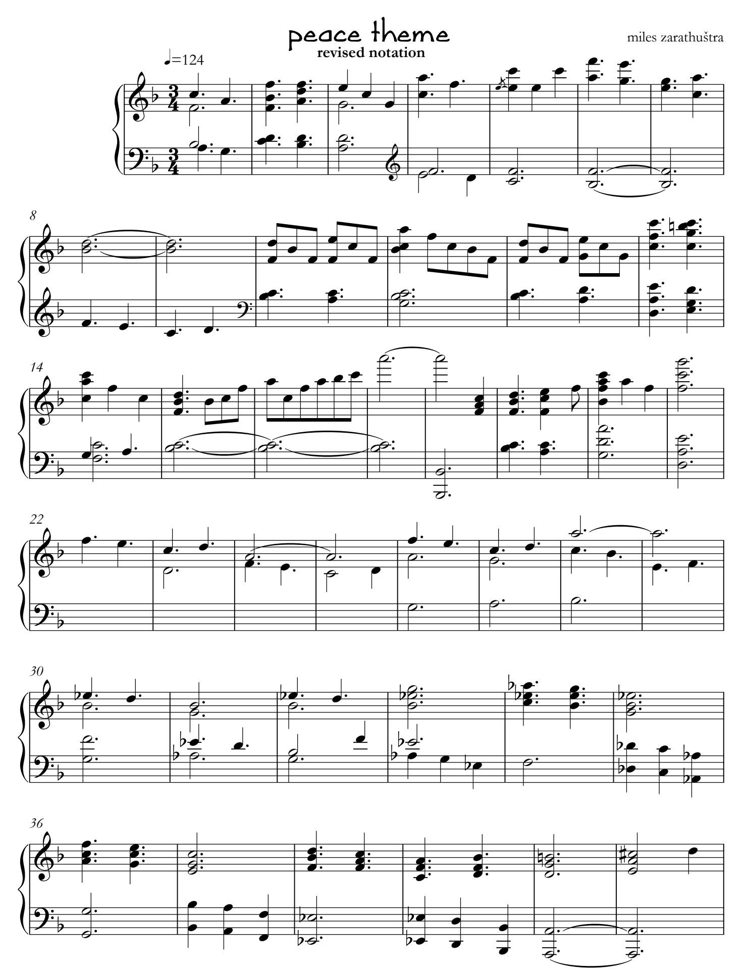
Copyright © 1985,1986, 2005 miles zarathuštra